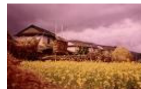
Mustard field AT Dhampus

Lunch will be served and there after you will be escorted to the Gurung (also know as Gurkha) village to see the way of life of the Villagers and Dinner and overnight stay at Dhampus .