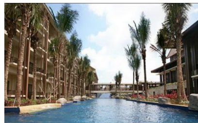
Deluxe Pool Access