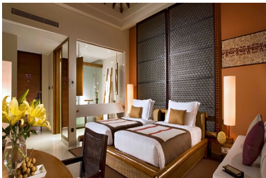
Deluxe Mountain View