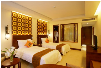
Deluxe Pool View