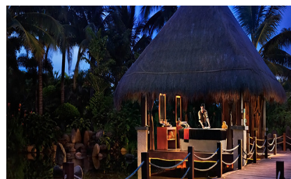
Deluxe Ocean View